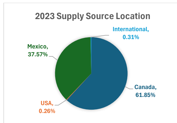
Figure 2 - 2023 supply source by location.